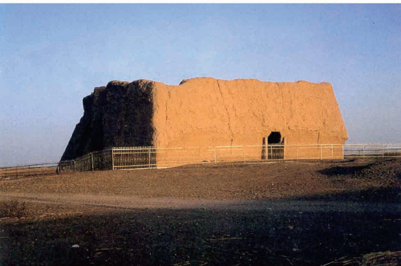
小方盤城 Yu-men Gate