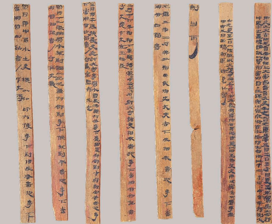
元康五年詔書 Imperial Edict of 61 B.C.

In order to effectively support the defence of frontier fortresses with quick communications, as well as warning and commands signals, the Han dynasty (206 B.C.–220 A.D.) built roads and established post stations between the interior prefectures and principalities and the northwestern frontier fortresses. Furthermore, the imperial Minister of Finance and the interior prefectures and principalities continuously sent soldiers, foodstuffs, equipment and money to the frontier fortresses. Garrison soldiers and their families were separated by thousands of miles and wrote frequently to each other. Much information from government orders to mundane details of personal lives can be found in the wooden slips.