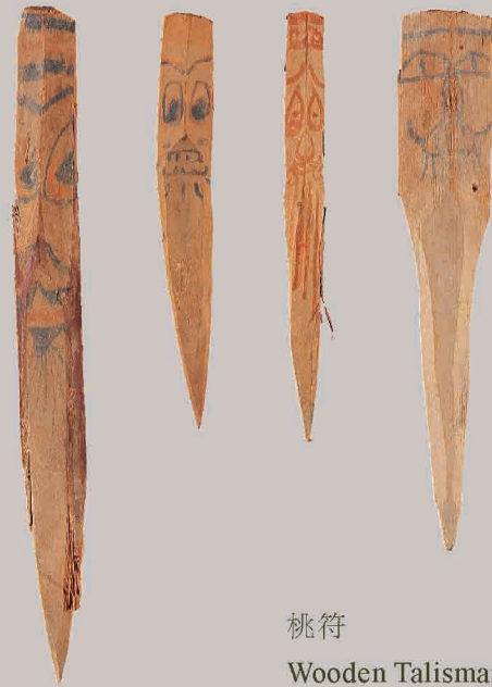
桃符 Wooden Talismans

《漢書·地理志》說自武威以西，「其民或以關東下貧，或以報怨過當，或以誄逆亡道，家屬徙焉，習俗頗殊。」從他們遺留的簡牘文書中，還可以尋繹出一些不一樣的生活面貌。