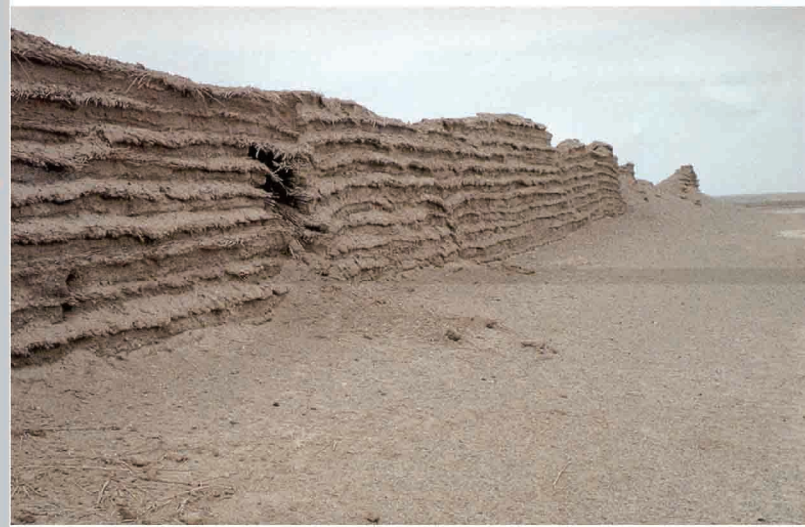
敦煌西部塞牆 Ramparts west of Tun-hung

Opening date: 2015.10.21 Venue: Han Dynasty Wooden Slips from Edsen-gol (Room 201)