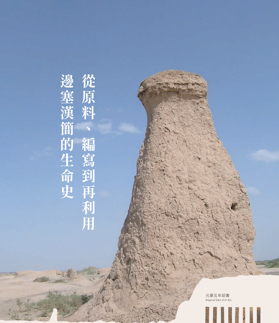
元康五年詔書 Imperial Edict of 61 B.C.